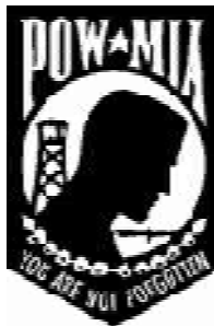
Badges, Pins and Ribbon of a "Proud Blue Star Mother"

**REMEMBER OUR POW/MIAs** www.pow-miafamilies.org "Bring 'em home or send us back!"