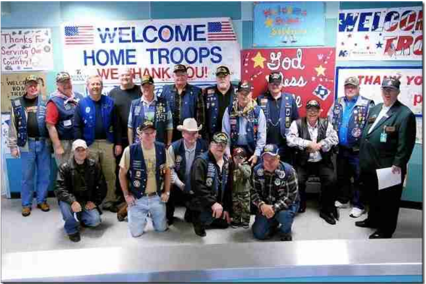
Some of our DFW Greeters. Good lookin' crew.