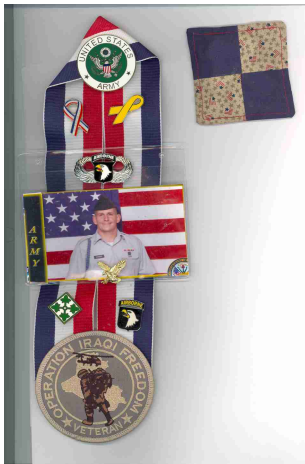
Pocket Prayer Quilt

The Blue Star Service Banner is a long-standing American tradition. First used during World War I, the banner was designed by a U.S. Army captain who had two sons serving on the front line. Soon, it became an unofficial symbol of a child in the service, now it is the symbol of an active duty military person in the immediate family.