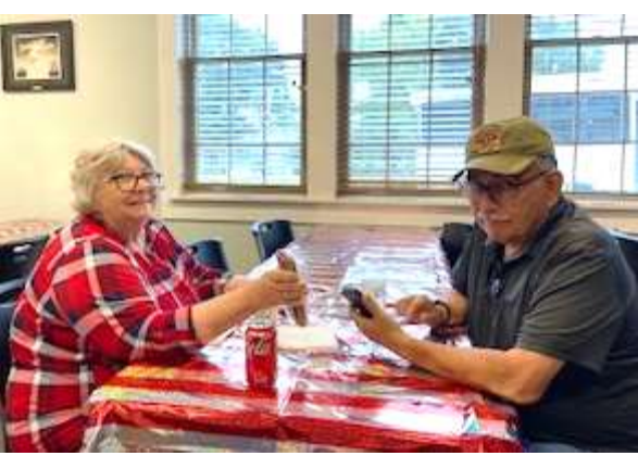
Good Food ~ Great Camaraderie