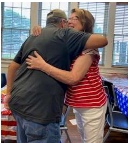
VVA 920 Family Gathering 7/1/2023